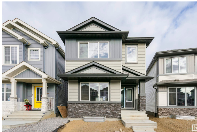
9530 Carson Bend SW, Edmonton, AB

Main Floor Exterior Area 74.32 m 2 Interior Area 68.37 m 2